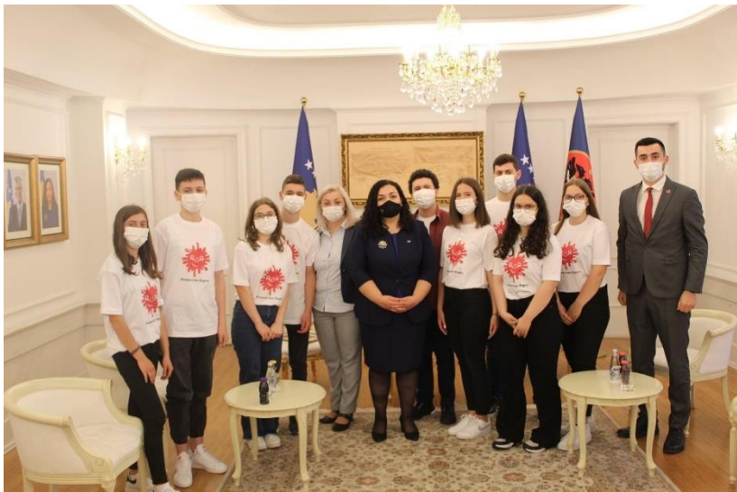
Figure 3. Group picture of children with President Osmani

My message to children all around the world is to never stay quiet when your rights are violated. I encourage you to always seek equality and justice! I also ask you to respect all of your friends and I want to remind you, I am here for you and that you are not alone! Together, we can make this world more colorful and bring smiles to all children around the world!